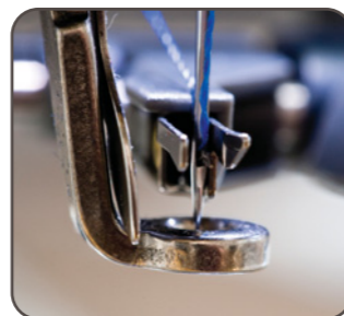
Automatic needle threader