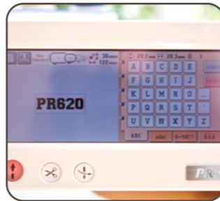
Built-in Keyboard Lettering