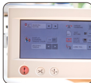
Colour thread information