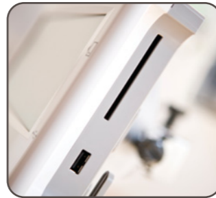
USB port and memory Card