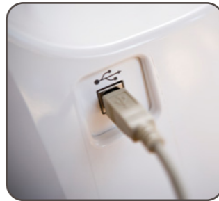
2nd USB port