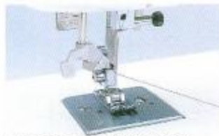
F.A.S.T. NEEDLE THREADING SYSTEM