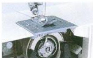
DROP FEED LEVER