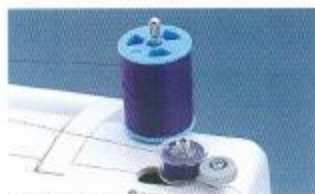
AUTO-DECLUTCH BOBBIN WINDER