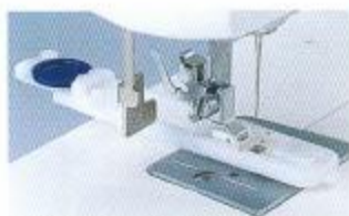
1-STEP "AUTO-SIZE" BUTTONHOLER (XL-5700, XL-5600)