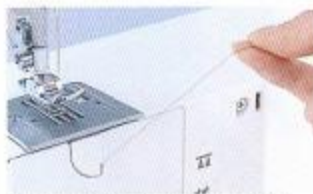
FAST START BOBBIN (XL-5700)