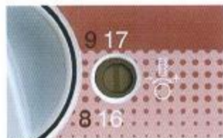
STITCH BALANCE CONTROL